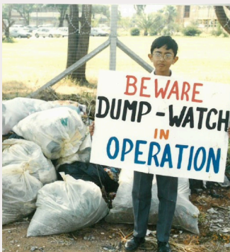
Anti - Dumping Campaigns

In addition to the community impacting the school, Park Primary School has also left its mark in contributing towards societal progress. This includes: