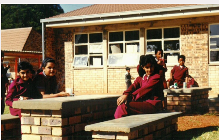
Brick tables with seating