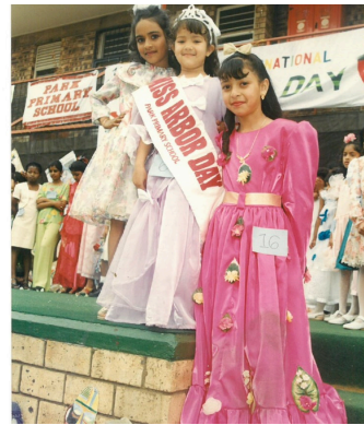
Learners celebrating Arbour Day