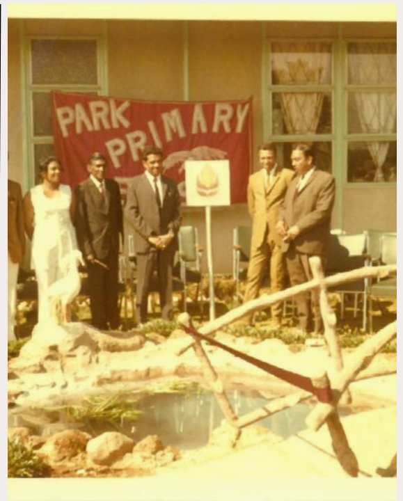
Park Primary School in its early days, featuring the iconic bridge and pond that once graced the school