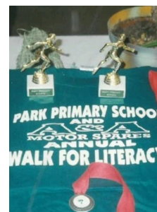
The Annual Walk for Literacy held at PPS