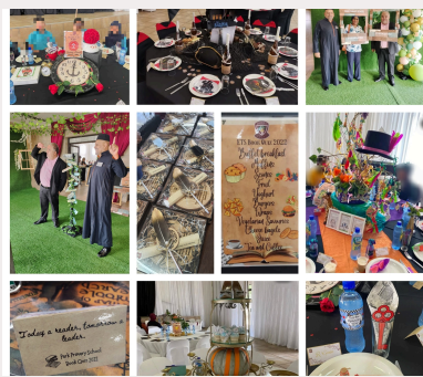
Park Primary School Hosted the ETS Book Quiz in 2022.