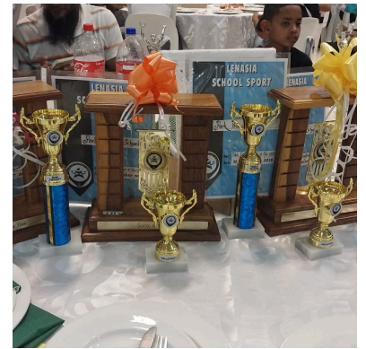
Park primary School featuring at LSS Awards evening