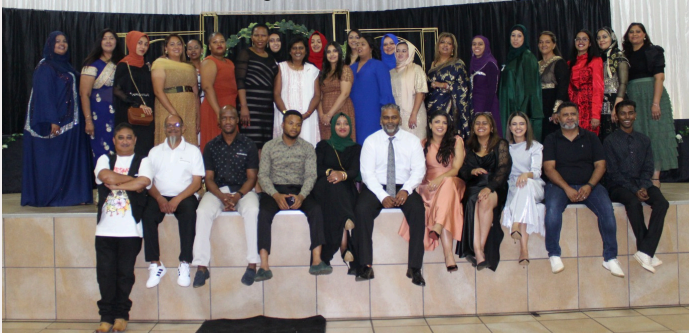
United in purpose, driven by passion - Park Primary's staff, the heart of our school family!

We remain steadfast on our mission of continuing the next 60 years inspiring young, vibrant minds, transforming lives and building a better, brighter future.