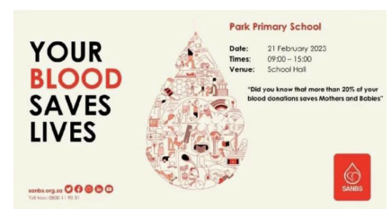
Regular Blood Drives in conjunction with SANBS held at Park Primary School