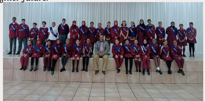
Leading with pride, inspiring with action - Park Primary's 2025 House Leaders, the voices of tomorrow!