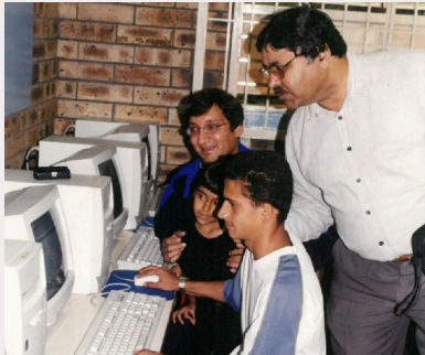
Park Primary School introducing its first computer classes