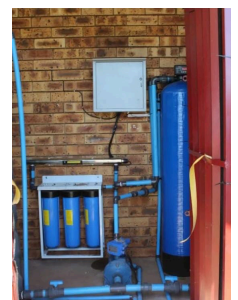
The completion of the Borehole at PPS