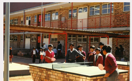
Table Tennis Structures